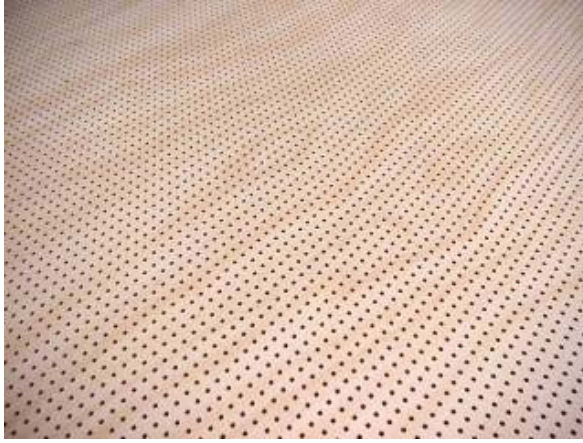
The natural hoop pine grain is still apparent, despite perforation.