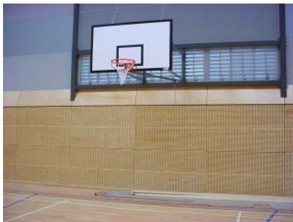
Acoustic plywood with slotted perforations used in a gymnasium - Auckland, New Zealand.